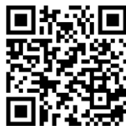
Team Managers Meeting